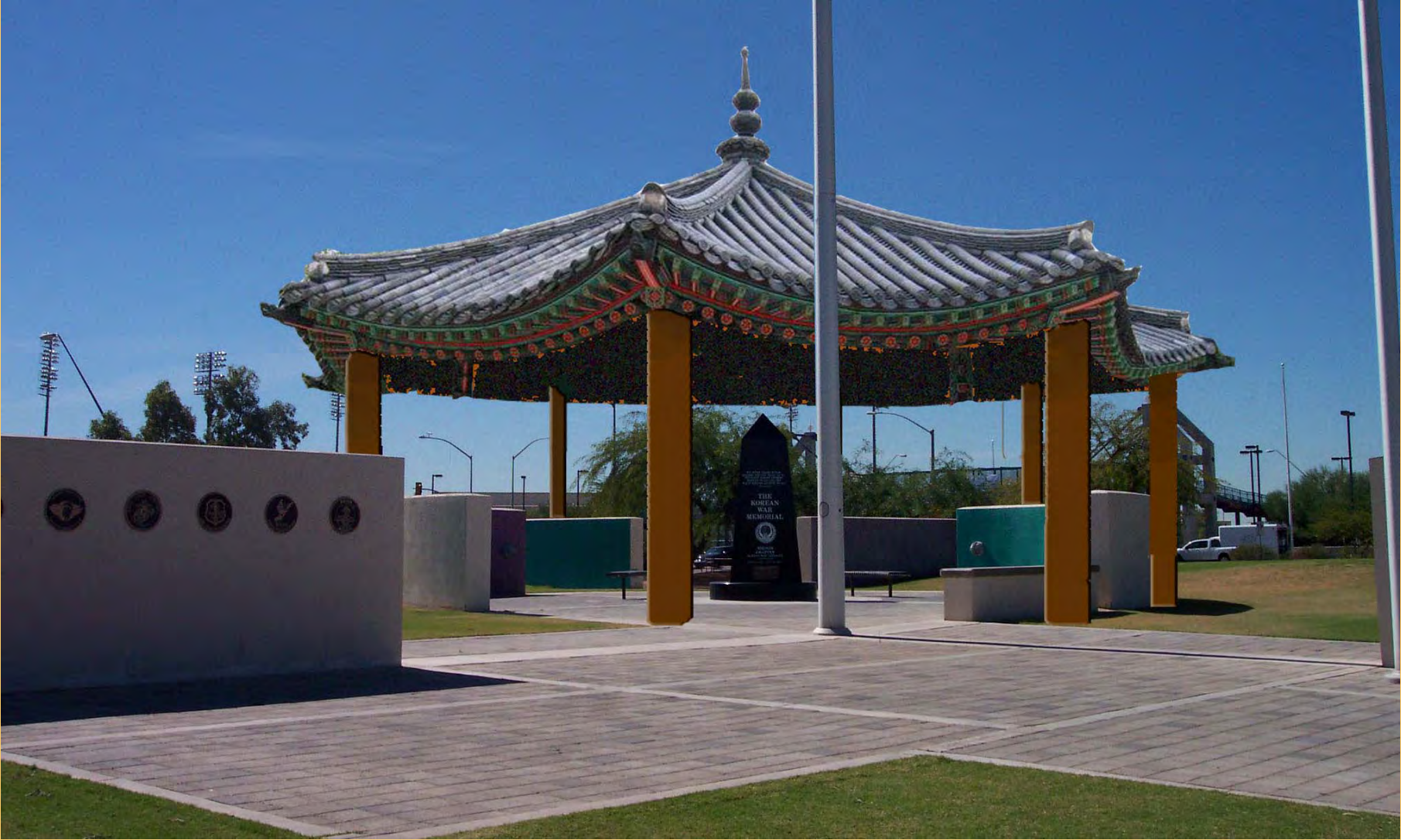
From Pedestrian Bridge