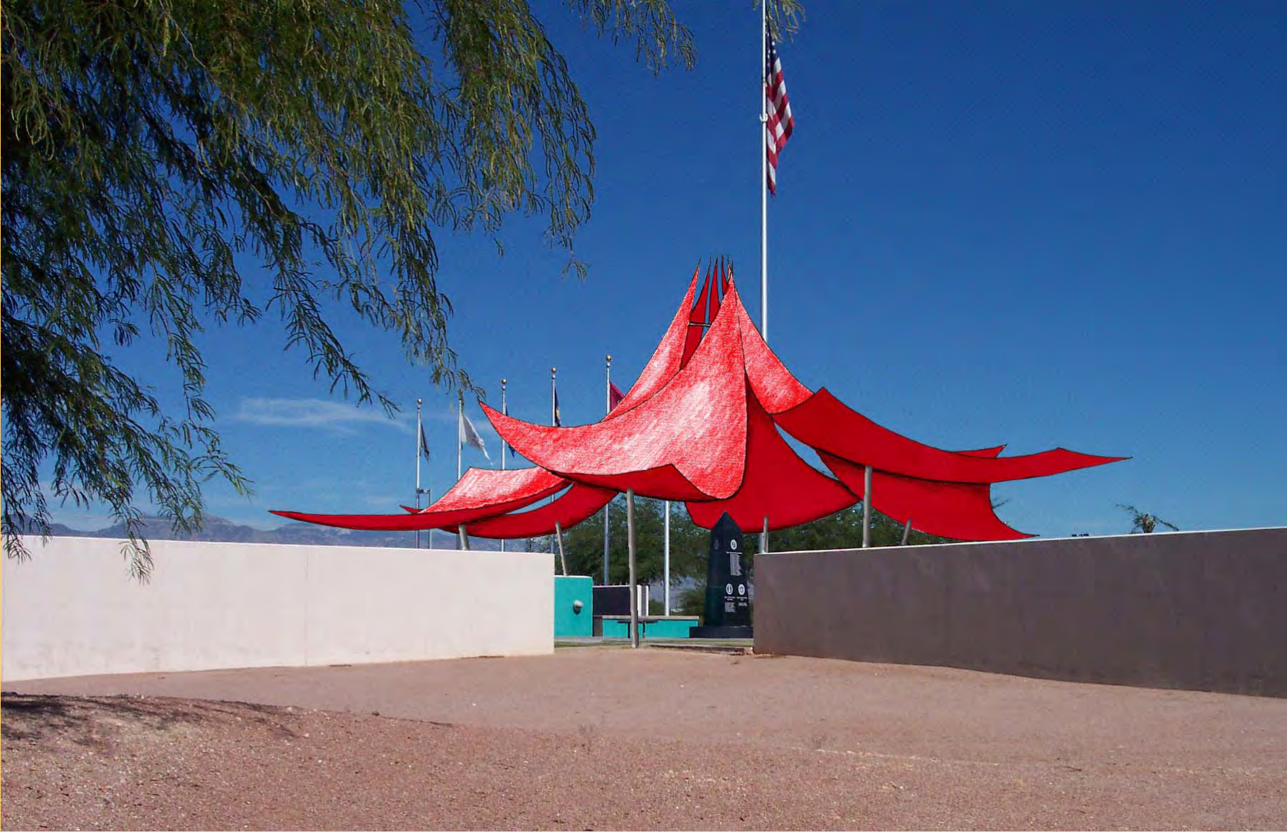
Corner of Ajo and Forgeus