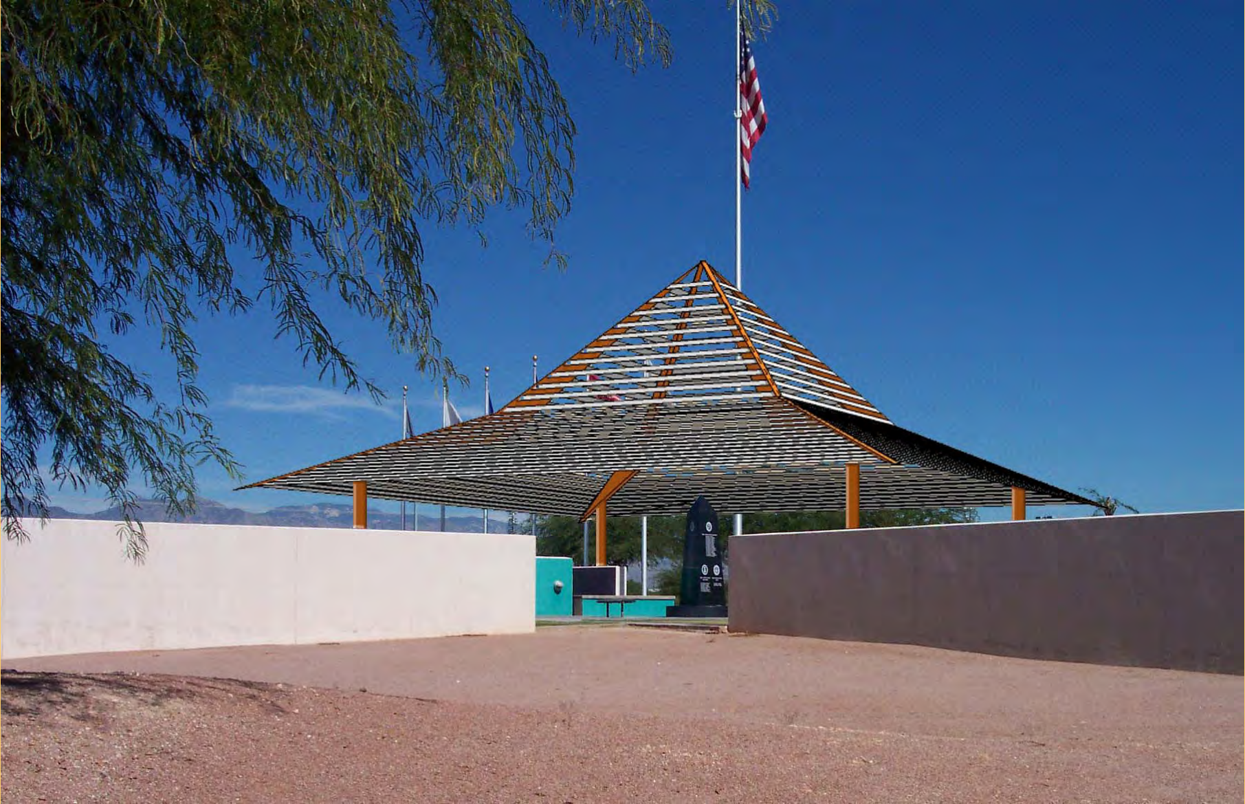
Corner of Ajo and Forgeus