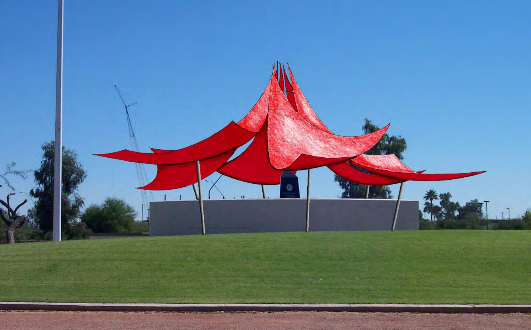
From Sidewalk through Park