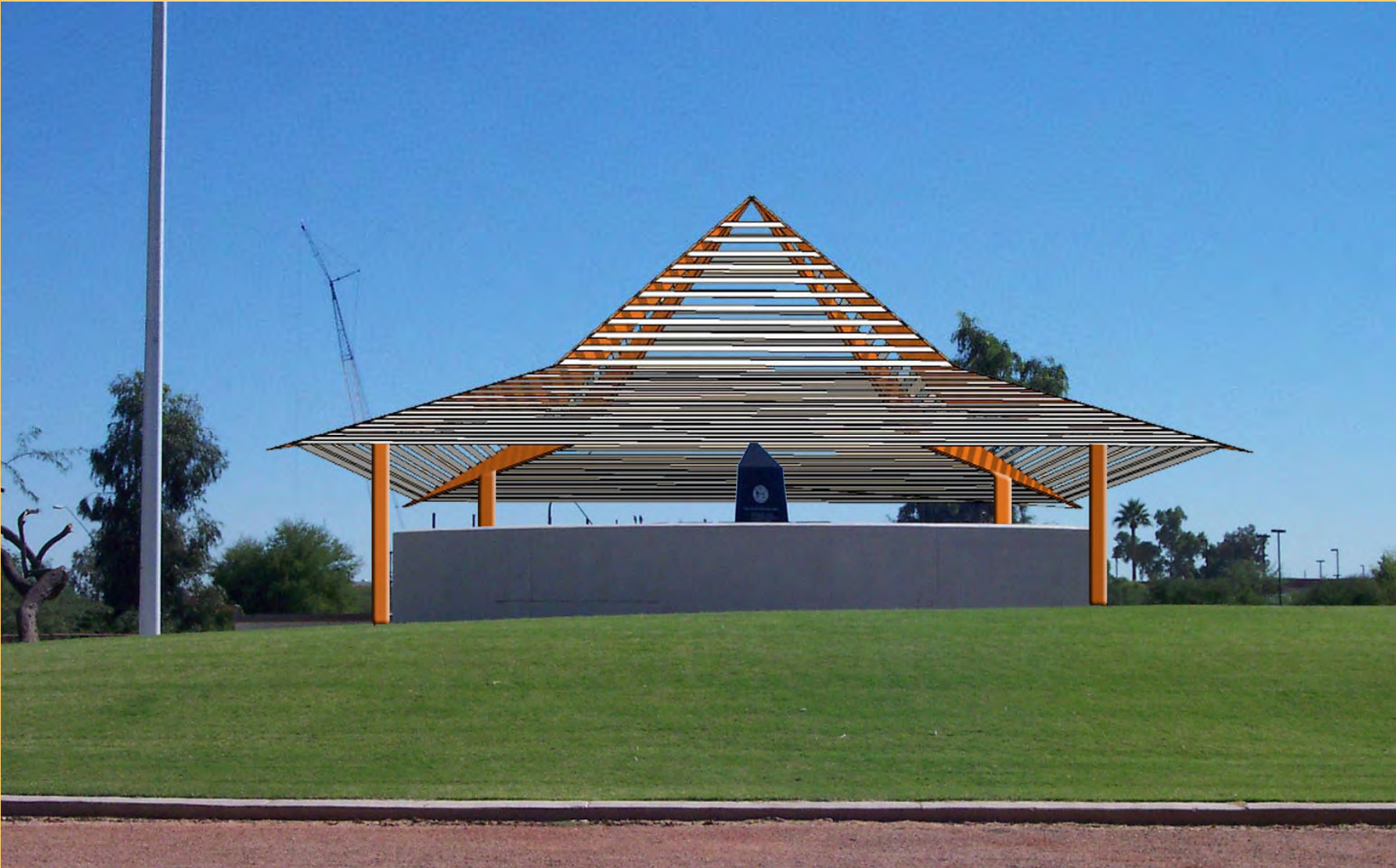
From Sidewalk through Park