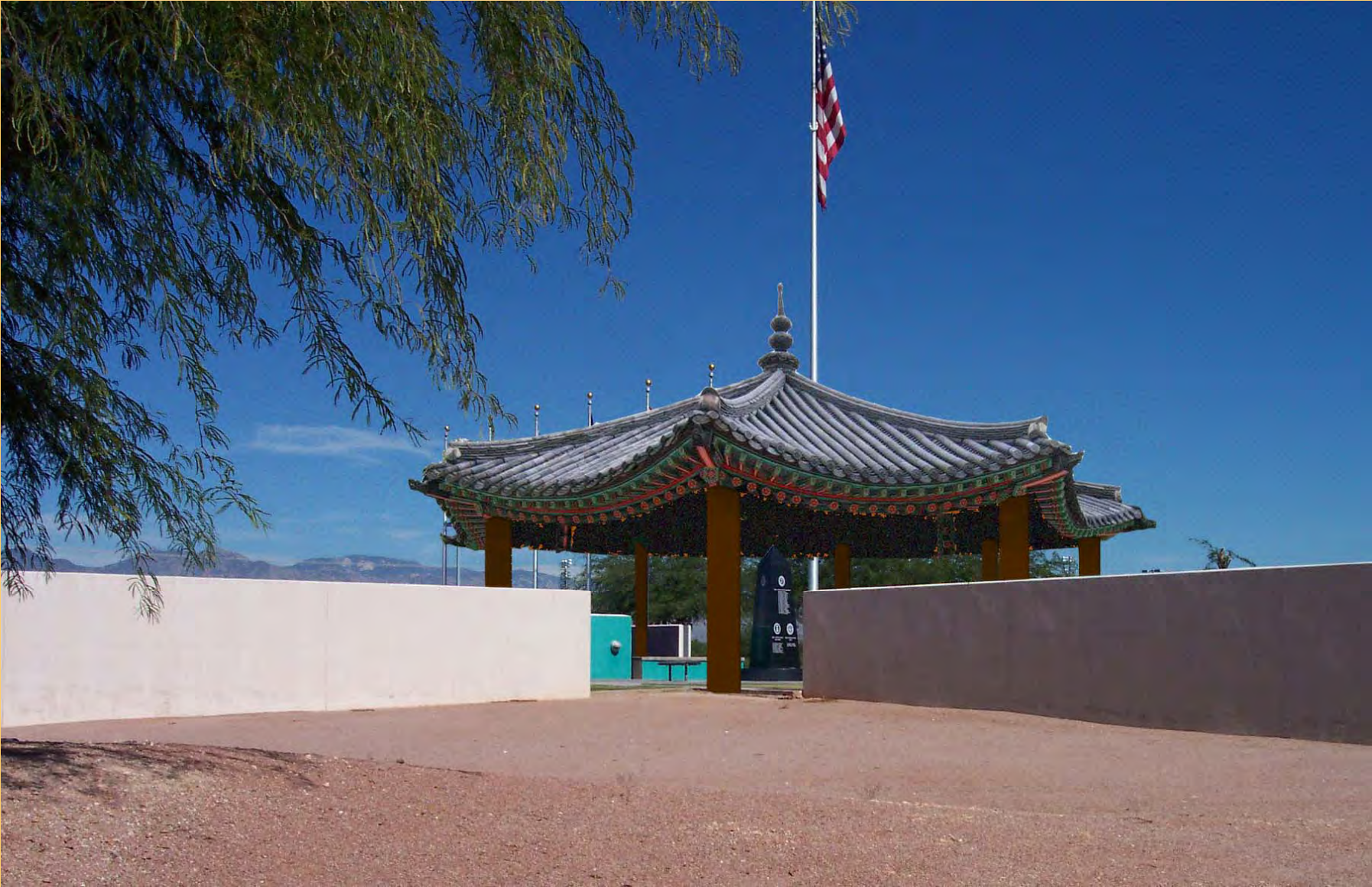
Corner of Ajo and Forgeus