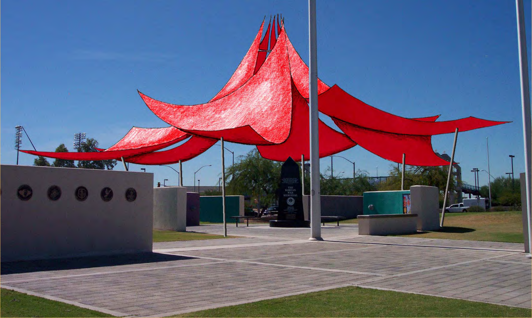
From Pedestrian Bridge