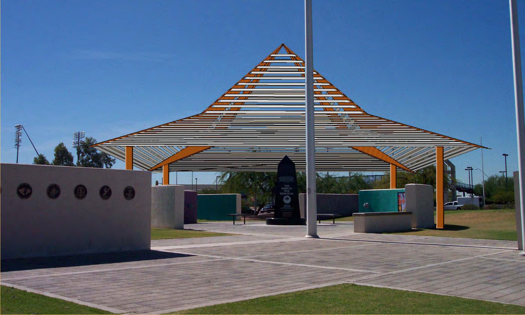
From Pedestrian Bridge